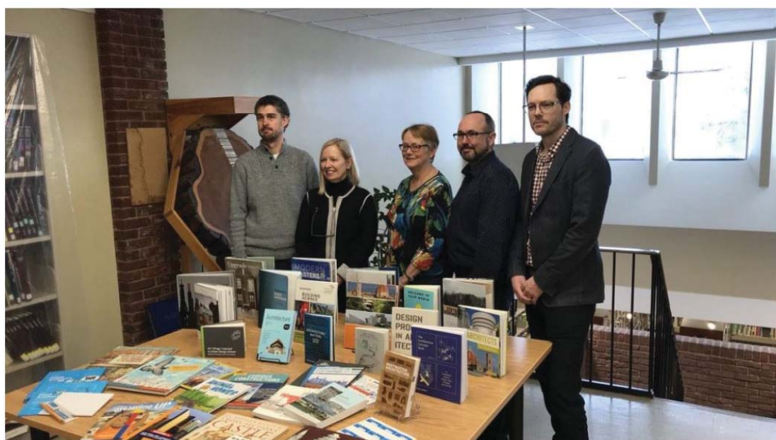
The North Bay Society of Architects is spreading the word on architecture.